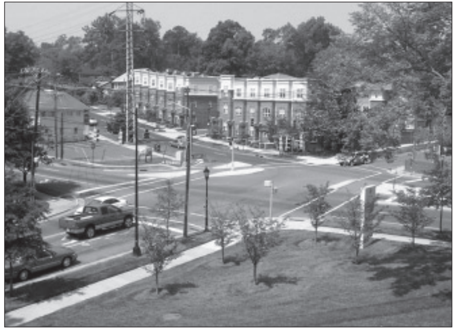
Figure 4. Redesigned intersection of Kenilworth and Romany in Charlotte, NC, USA.

Many of the suggested pedestrian crossing improvements flow directly out of the traffic speed control measures noted above. They include: