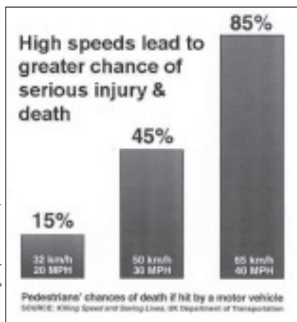
Figure 3. Vehicle speed versus injury and death.