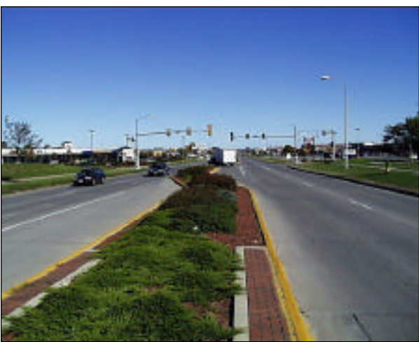
Four-lane arterial with raised median, Ankeny Boulevard, Ankeny, Iowa.