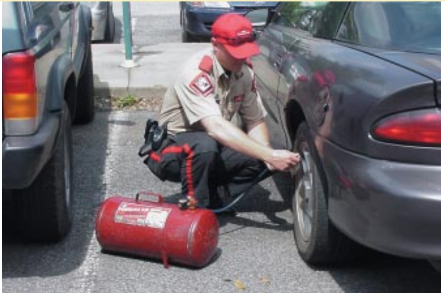
BID staff stand ready to offer assistance to stranded motorists in Birmingham, Alabama.

■ Plan holiday and other special events to give people an extra reason to visit and bond with the shopping district.