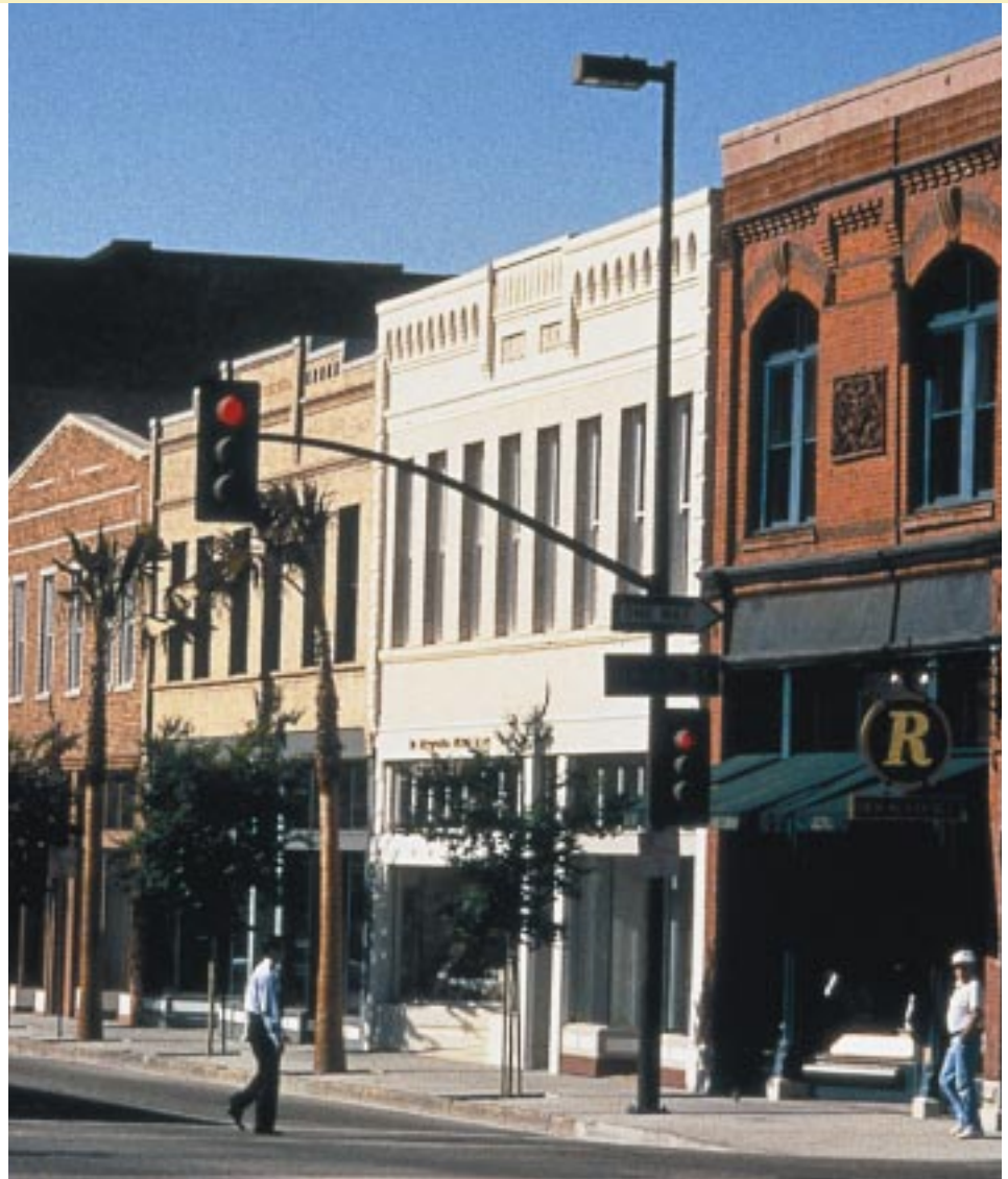
The revitalization of Old Pasadena, California, incorporated new retail trends for shopping and entertainment in a historic main street environment.

right to rebuild them. Numerous metropolitan trends are redirecting growth back into existing communities, which has positive implications for the rebirth of neighborhood retailing. Urban lifestyles are becoming more popular among empty nesters, singles, the elderly, and nontraditional households; immigrants are flocking to many neighborhood streets as low-cost places to open small businesses, stores, and restaurants; retailers are again interested in urban locations because their traditional suburban markets are saturated; states are increasingly concerned about the effects of sprawl and are instituting smart growth policies; pedestrian-oriented, streetfront retail environments are gaining favor with today's consumers; inner-city crime has declined dramatically in the past ten years; and local governments are using increasingly sophisticated planning, regulatory, and financial incentives to encourage market-based real estate investments in distressed urban neighborhoods.