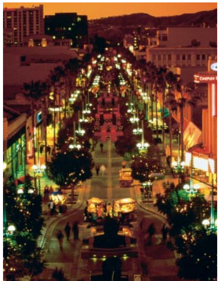
As the sun sets, Third Street Promenade in Santa Monica, California, lights up. The well-lit pedestrian street remains active long after dark.