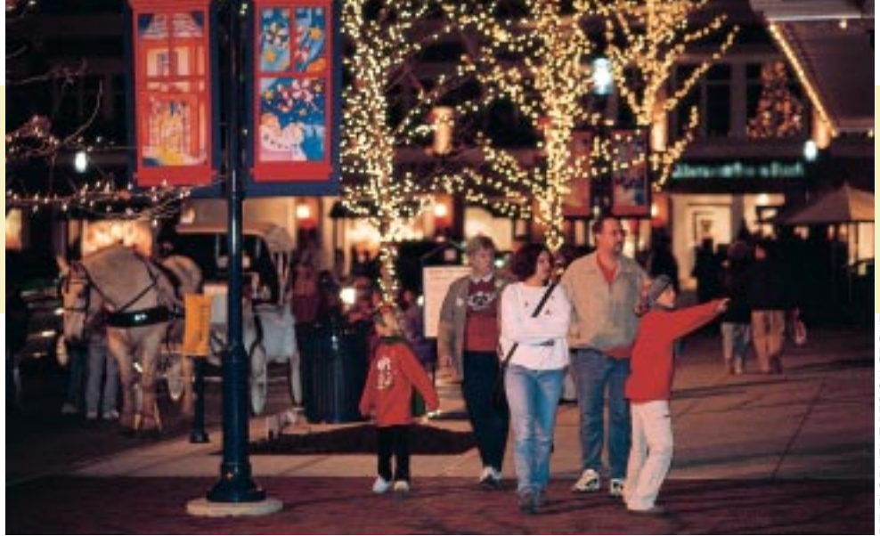
Signpost decorations, tree lights, and a handsome cab set the scene for an exciting evening during the winter holiday season. Holiday decorations and festivals are a great way to attract families to a shopping area during the evening hours.

■ Educational facilities, such as university satellite campuses, should also be encouraged because they bring teachers, students, and educational workers to the neighborhood. A bonus is that they fill off-peak parking spaces.