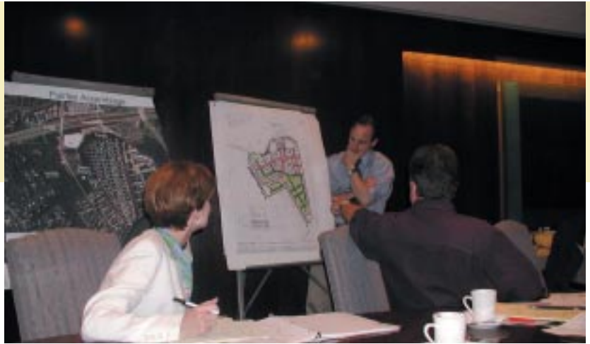
Visioning will help create and enhance an identity for the street that reflects the neighborhood.

The first task of the public/private partnership is to make sure that the vision is shared. Property owners, residents, and nontraditional neighborhood anchors, such as churches, colleges, and hospitals, must buy in because they have the most at stake. These players have a strong vested interest in the neighborhood environment because their success depends in part on desirability of their surroundings. Large employers should be actively recruited because they have important resources that can be brought to bear.