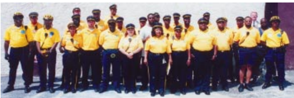
University City, Philadelphia, Pennsylvania.