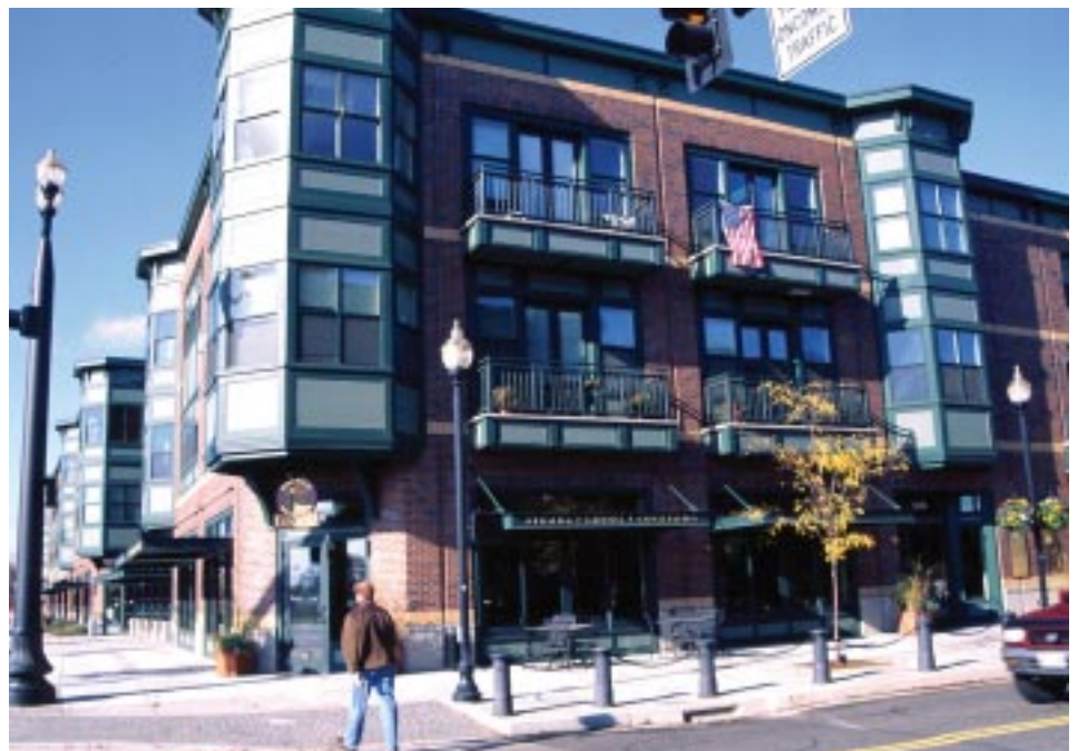
Orenco Station, Hillsboro, Oregon.

The challenges of rebuilding persist not only in low-income neighborhoods, but also in many other urban locations where retailing never recovered from the shift of buying habits that led people to suburban shopping centers. Even in some of the most affluent communities—where first-generation, auto-oriented shopping streets have begun to urbanize and take on characteristics of urban shopping districts—redevelopment efforts are often stymied by NIMBYists