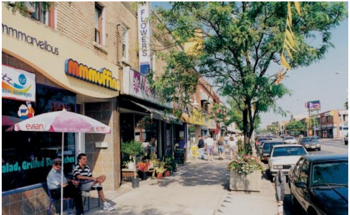
Bloor West Village in Toronto, Ontario.

In spite of the challenges faced by neighborhood retail streets, their future is turning much brighter, and the Urban Land Institute believes that the timing is