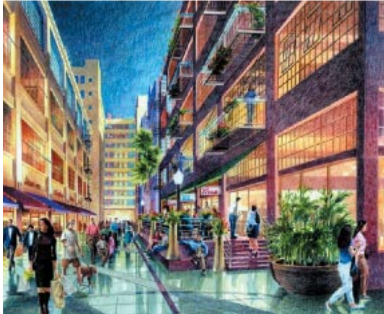
Residential units above retail keep the street active around the clock, providing convenience for residents and sales volume for retailers.

■ Don't underestimate the value of anchors on the street. They help the smaller, independent tenants succeed by drawing customers to the area.