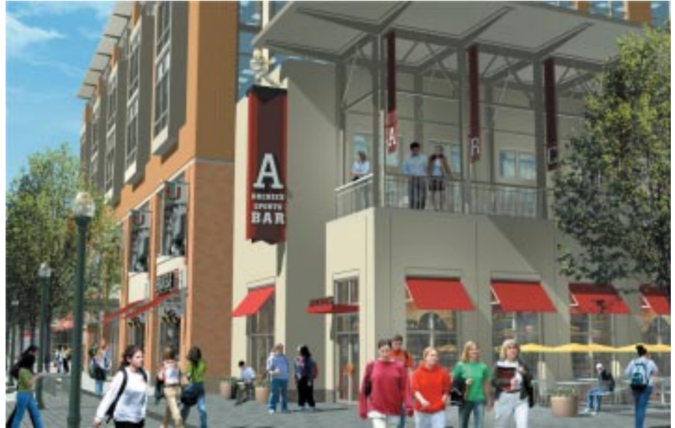
At Ohio State University, High Street, in Columbus, Ohio, is undergoing a revitalization that will include 250,000 square feet of retail, restaurant, and entertainment space.

■ Representatives of the business community and citizen leaders should develop and nurture long-term relationships with public sector representatives who have responsibilities for the district to get an appropriate share of attention and funding. Public officials should likewise reach out to the business and citizen leaders. Strong two-way working relationships will help to achieve both public and private goals over the long term.