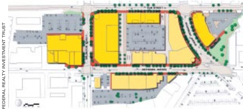
FEDERAL REALTY INVESTMENT TRUST

■ On-street parking is critical for some retailers' success because it is the most convenient type of parking and creates the steady turnover of shoppers needed by stop-and-go retailers like coffee shops, dry cleaners, and specialty food stores.