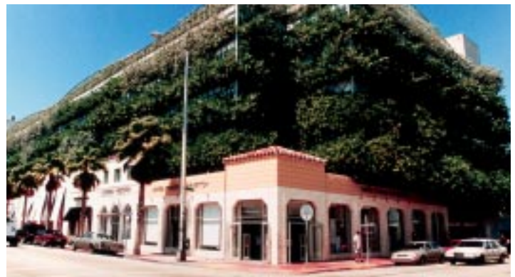
The parking garage at Seventh and Collins, Miami Beach, Florida.