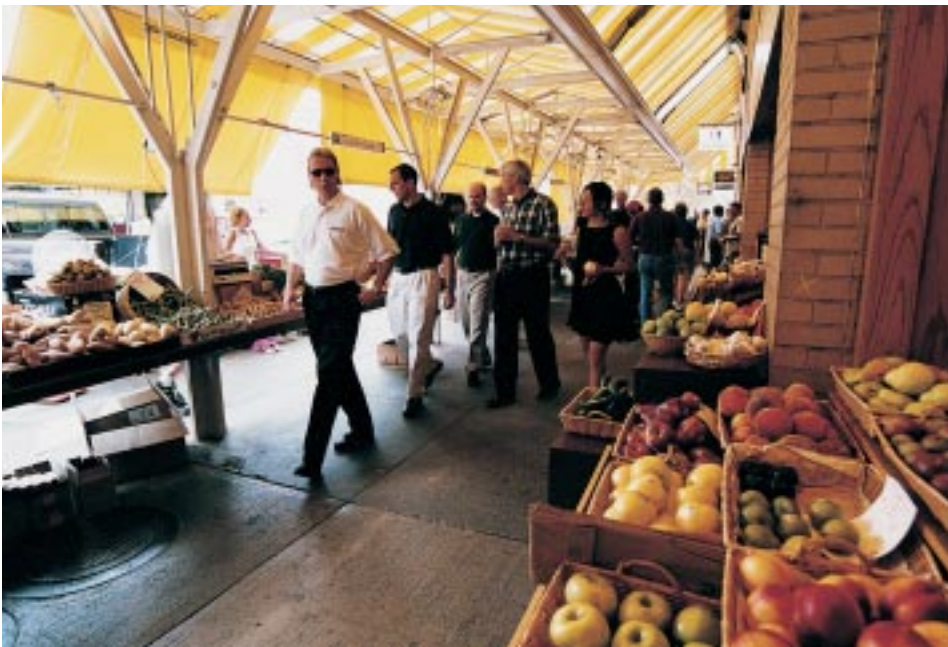
Produce markets, often sponsored by BIDs, add a lifestyle-oriented dimension to neighborhood shopping streets.

Communities have powerful financial and regulatory tools to attract desired private investment capital if used judiciously. Some of these tools are “carrots” that create a positive investment climate, improve infrastructure, or reward investors who further community goals. Others are “sticks,” which may need to be used if carrots are not sufficiently convincing. Communities should be willing to use both to convince landowners, developers, and retailers that the revitalization efforts are in their interests. Willingness to exercise regulatory powers to achieve the stakeholders’ vision and protect it from negative influences projects a sense of momentum to the stakeholders and potential tenants and enhances the street’s appeal as a place to do business.