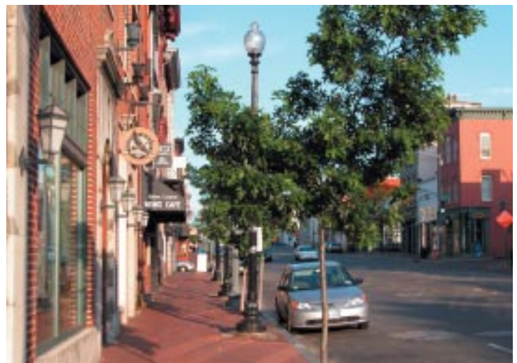
M Street, Washington, D.C.

■ Create an identity for the street that is inventive and reflects the neighborhood. Some neighborhood streets are already place-specific and have identities that can be reinforced or enhanced. In other cases, the identity is either nonexistent or negative—in which case, changing the perceived identity (or overcoming the nonidentity) will be one of the biggest challenges.