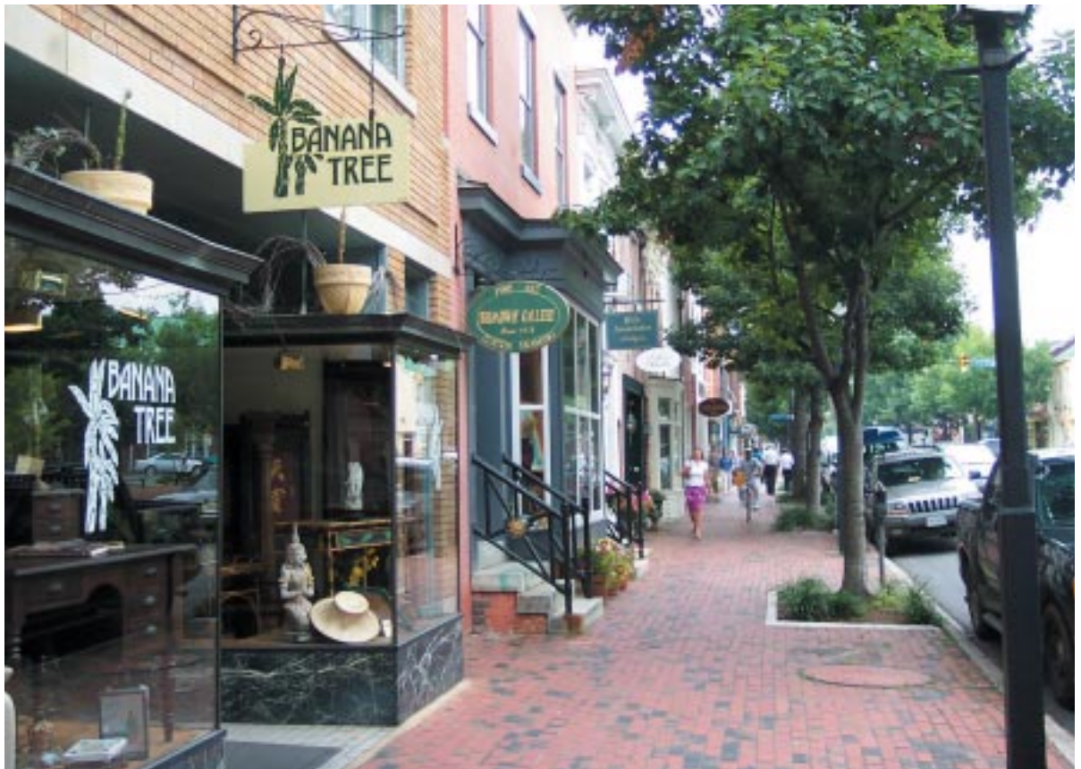
King Street, Alexandria, Virginia.

In some quarters, neighborhood revitalization efforts are seen as inherently public responsibilities that should be led exclusively by public representatives, because the private sector is often seen as unwilling, uninterested, or unable to do the job itself. Others believe that if a market exists, the private sector will find it and, without government help, lead the way through its own entrepreneurial efforts. ULI believes that, in most cases, neither extreme is an effective approach.