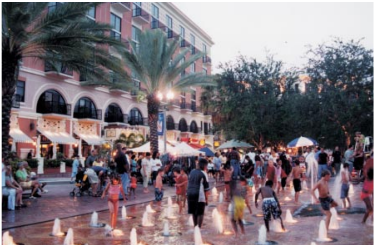
Clematis Street, West Palm Beach, Florida.

Rebuilding neighborhood retail should be planned comprehensively as an integral piece of the larger community that surrounds it, and it should be tailored to the realities of the area. Communities should focus their initial efforts on carefully chosen development nodes to maximize the impact of their efforts, create momentum, and foster faith in the project. As more resources become available, the focus should expand to neighboring blocks and streets. Individual strategies will vary widely because every street is different—each has its own set of problems and opportunities, each has a unique identity that can be capitalized on, and each will evolve over time as entrepreneurship grows. What usually begins