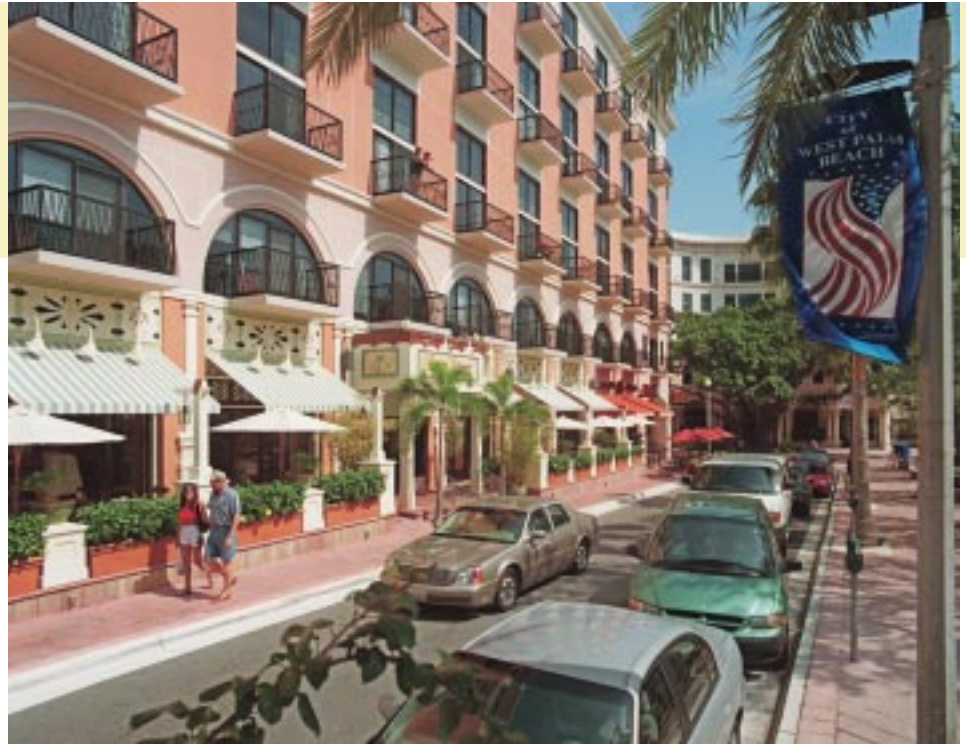
On-street parking along Clematis Street, West Palm Beach, Florida.

■ Don't forget about bicycle parking. Bicycles are a growing part of the urban lifestyle and parking for them is cheap to build. The need for bicycle parking is especially important in college communities and in neighborhoods with young, highly educated, and sophisticated residents.